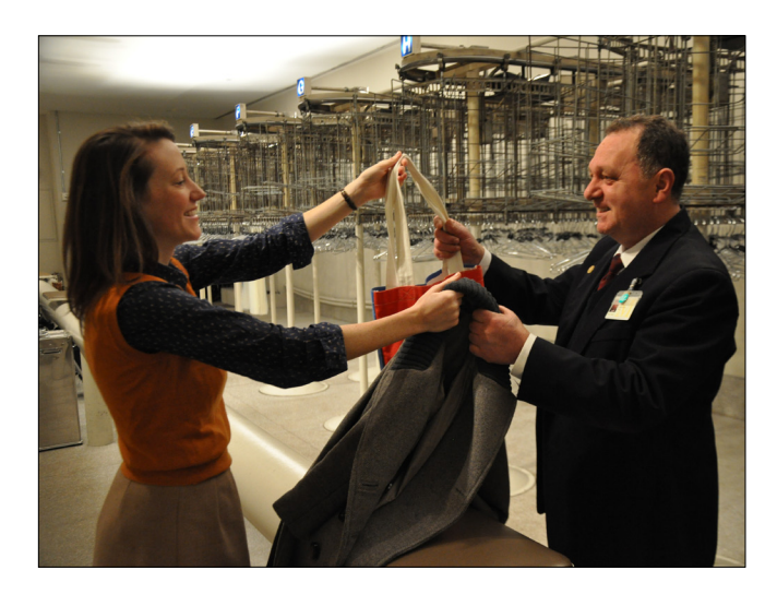
I hope I can visit the Museum again soon and see more art.

When I am ready to leave, I will go back to the Uris Center for Education entrance if that is where I came in. If I checked my coat, I may have to wait on a short line to get it back. I will give the security guard at the coat check my plastic tag so that he or she can find my coat and return it to me.