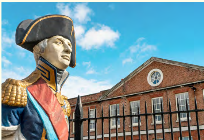
Portsmouth Historic Dockyard, England