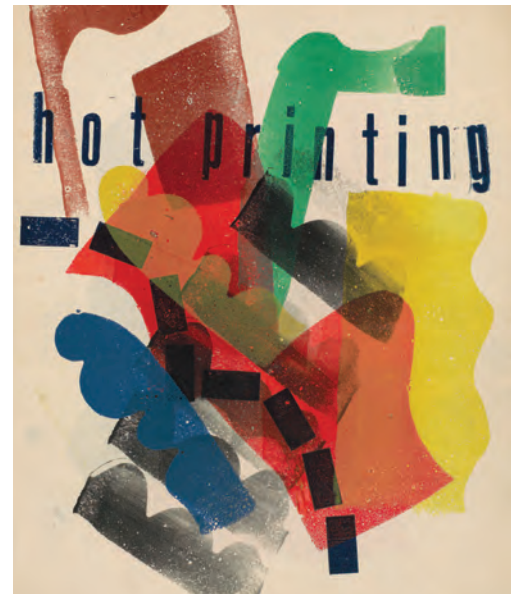
Photos clockwise from top right: Map of the region; Bruges, Belgium; Hot Printing, 1935-1936, template and hand press on paper, The GRID Grafisch Museum Groningen, Holland; Keukenhof Gardens, Holland; Mauritshuis, The Hague, Holland, Lübeck, Germany. Front cover: Groninger Museum, Holland. Back cover: Mont-Saint-Michel, France (top); Museum Island, Berlin, Germany (bottom).