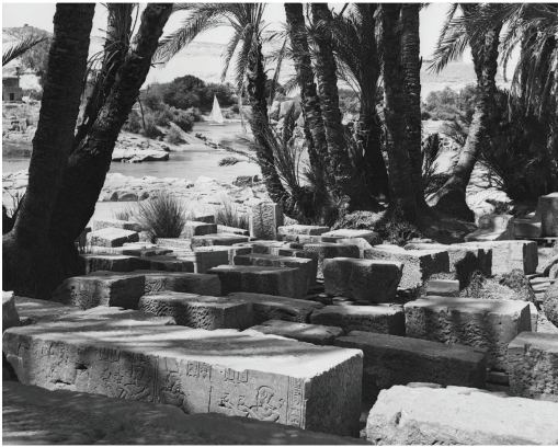
Above: The temple blocks waiting to be packed into crates in Egypt.

Egypt gave this temple to the United States as a gift. It was taken apart in Egypt, packed into 660 crates, transported by ship, and put back together again, block by block, at The Met.